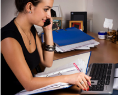
8. made three photocopies.' Which job fits in 'The the space?